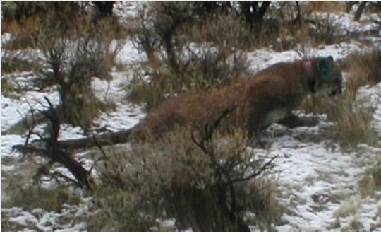
This is a mountain lion in Idaho. He is wearing a radio collar.