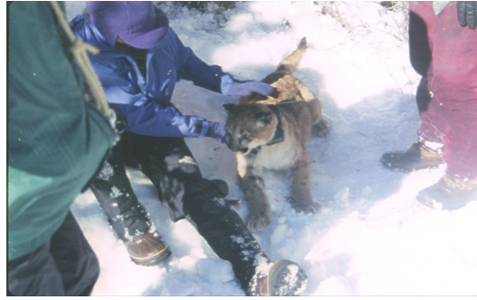
This kitten is about six months old.